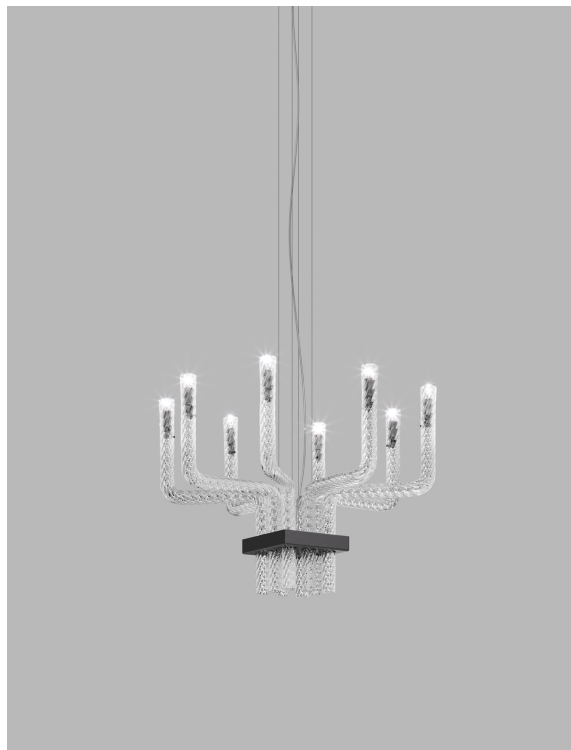
STRDU SP Q CRRI NN G9 CE